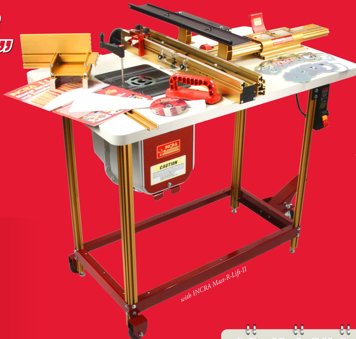
with INCRA Mast-R-Lift-II