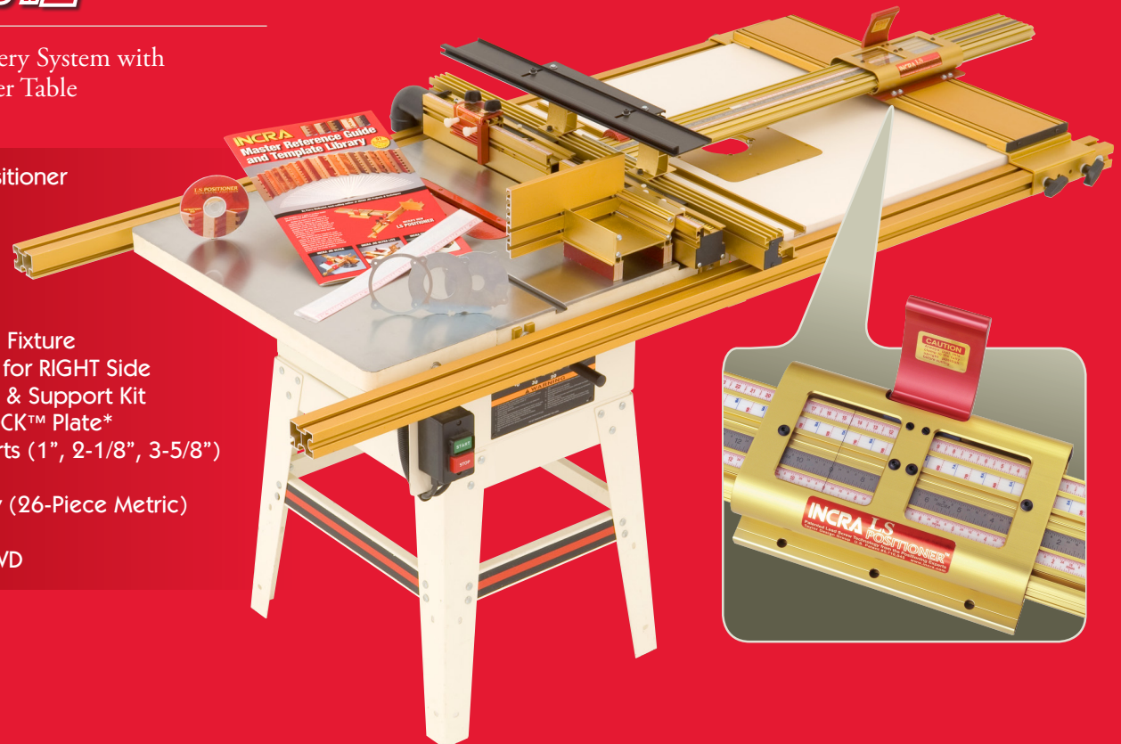
Table Saw Combo #4

52" or 1320mm TS-LS Joinery System with 28" x 32" Right Side Router Table (32" x 32" on XL version.)