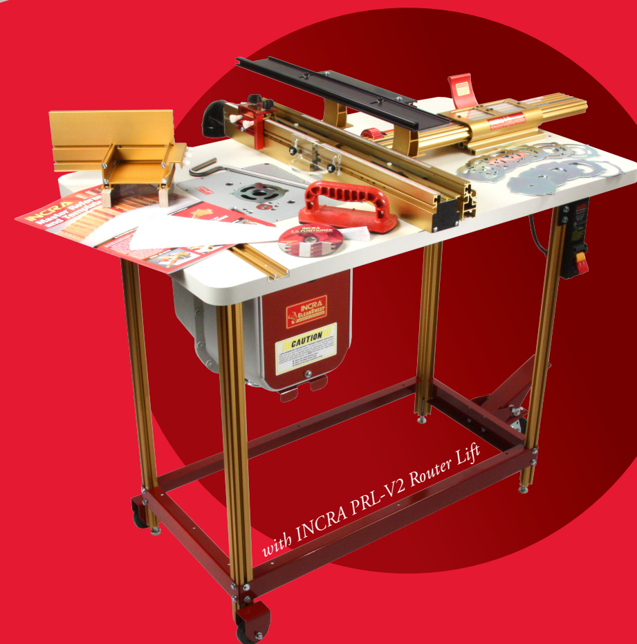
with INCRA PRL-V2 Router Lift