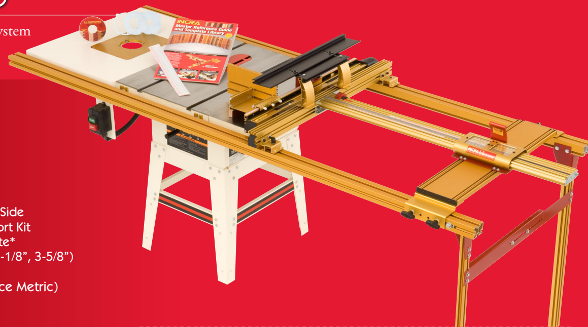
Table Saw Combo #2

32" or 810mm TS-LS Joinery System with 28" x 32" Right Side Router Table (32" x 32" on XL version.)