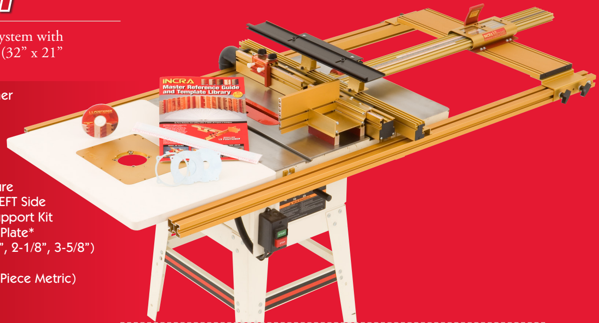
Table Saw Combo #3

52" or 1320mm TS-LS Joinery System with 28" x 21" Left Side Router Table (32" x 21" on XL version.)