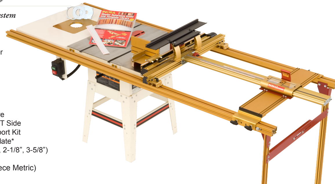
Table Saw Combo #2

32" or 810mm TS-LS Joinery System with 28" x 32" Right Side Router Table (32" x 32" on XL version.)