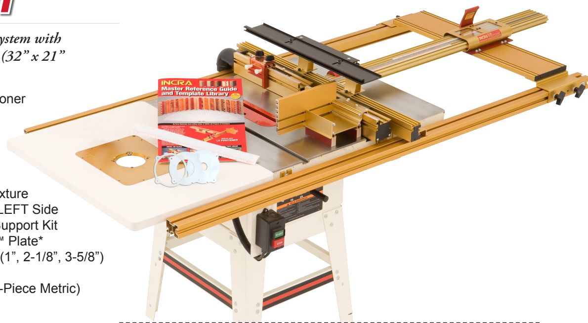
Table Saw Combo #3

52" or 1320mm TS-LS Joinery System with 28" x 21" Left Side Router Table (32" x 21" on XL version.)