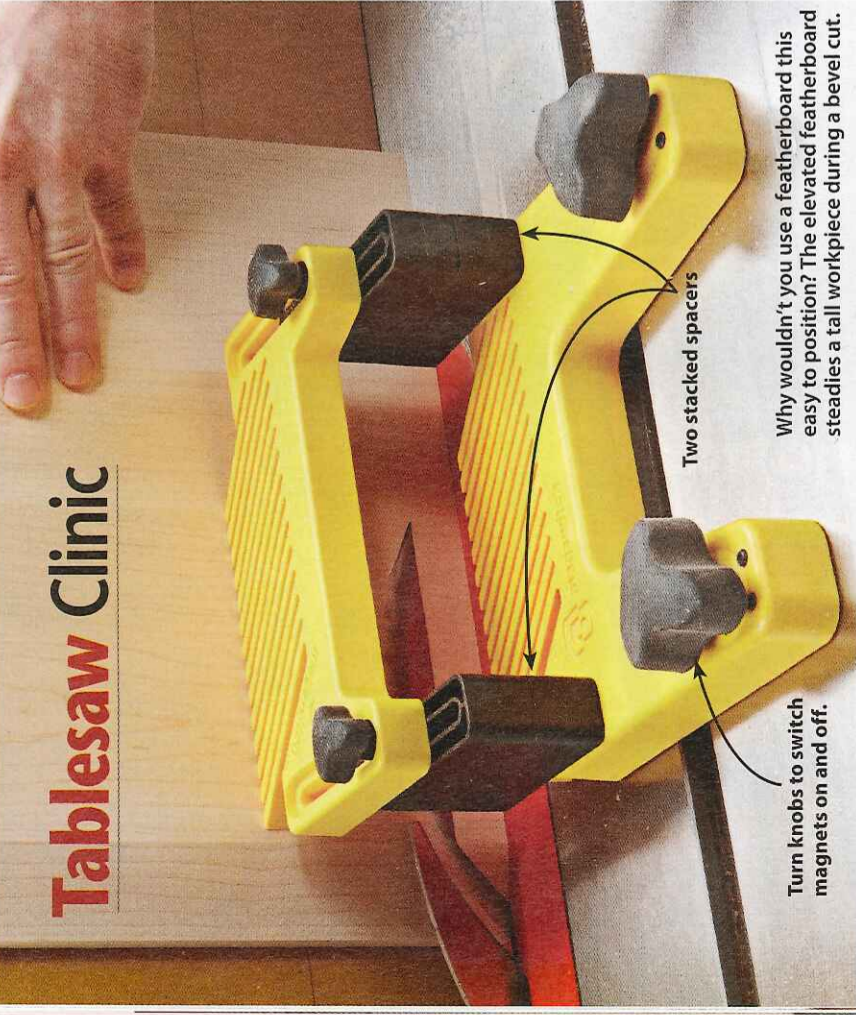
Turn knobs to switch magnets on and off.